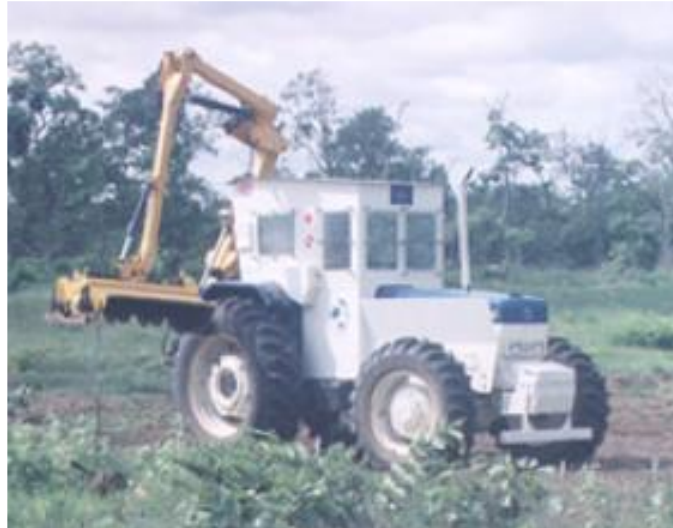
Figure 3: Armoured Tractor fitted with Vegetation Cutter ( Reference: IMAS TN 09.50/01 )