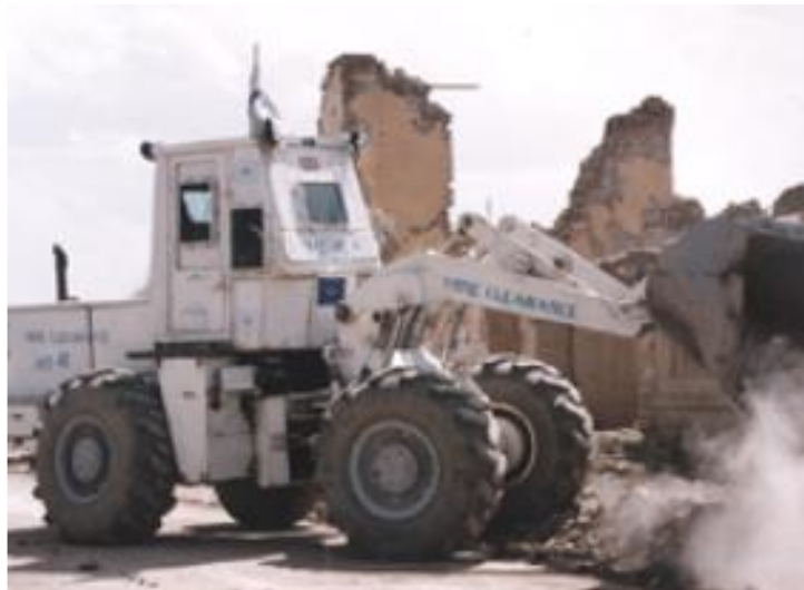
Figure 2: Armoured Front-end Loader removing rubble ( Reference: IMAS TN 09.50/01 )