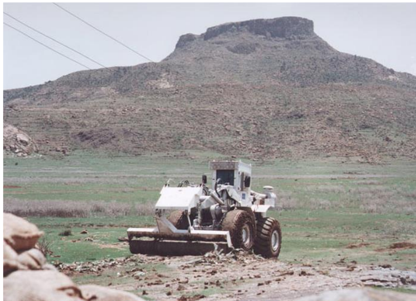
Figure 1: Armoured Front-end Loader with AP Mine Rollers ( Reference: IMAS TN 09.50/01 )